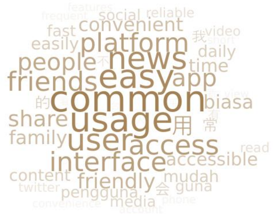
Why did you choose these alternative platforms?

The word cloud illustrates that the most frequently used terms among respondents include: ‘convenient’, ‘common’ (‘biasa’, ‘常’), ‘friendly’, and ‘accessible’.