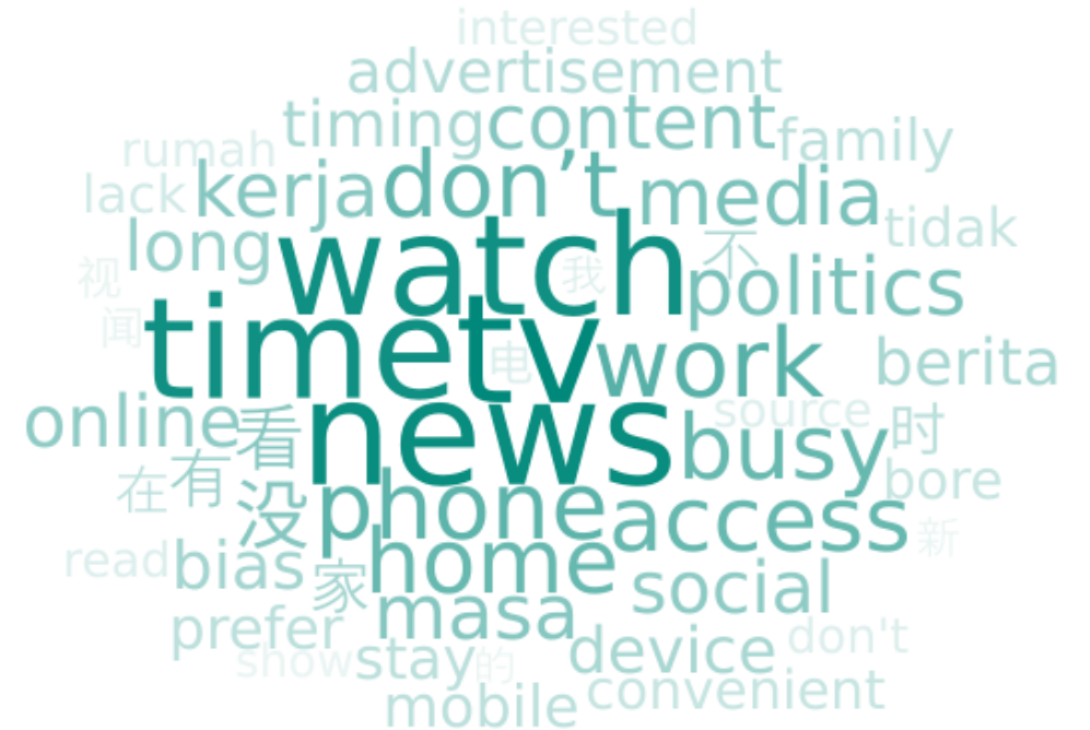
What reasons / elements hinder you from watching news on TV?

Perlis interviewee: “I think with TV news, you just have to put aside some time to watch it and I don't have the time to do that, that's why I opt for the easier version that also provides me with the similar information that I want”